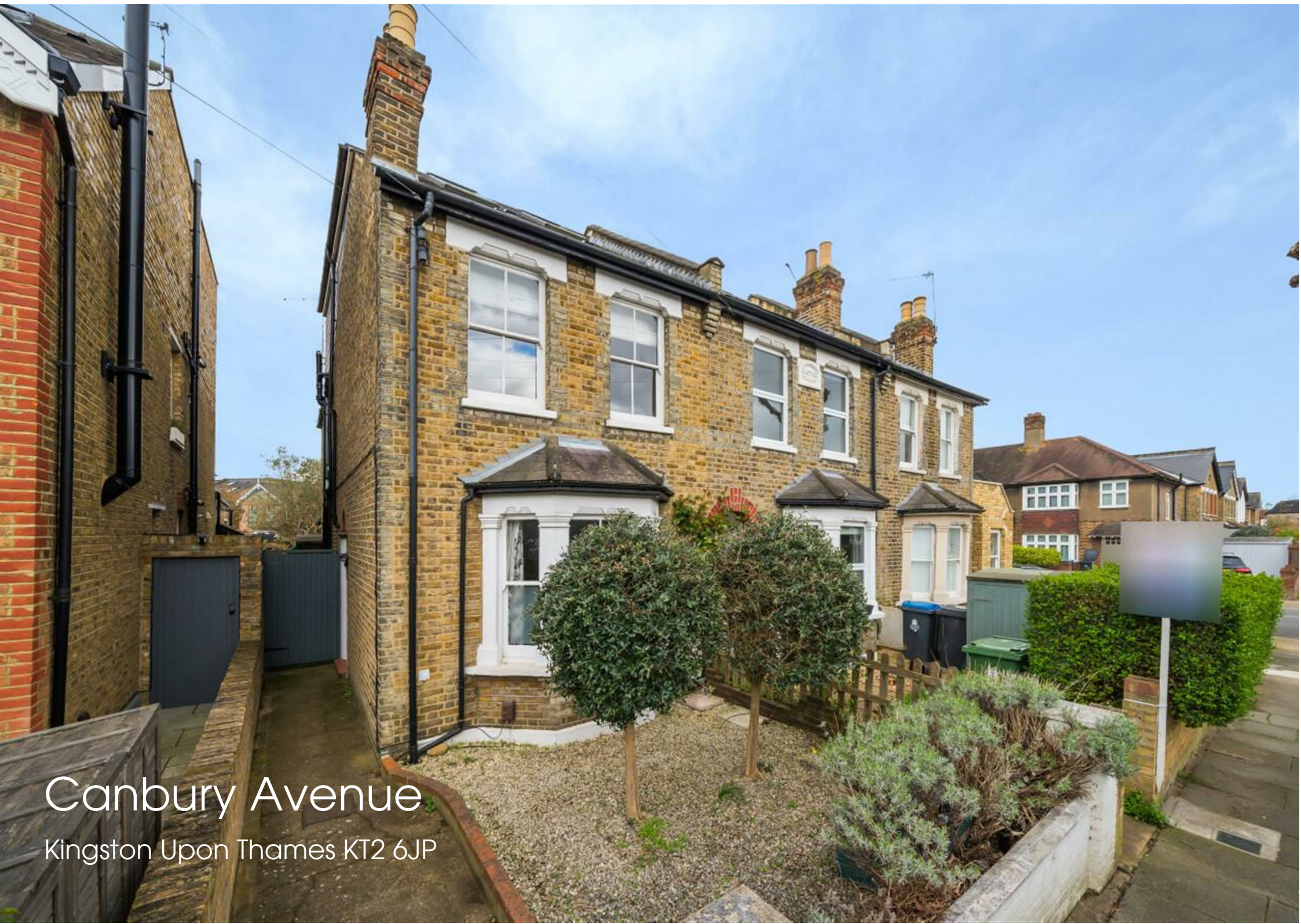
Canbury Avenue Kingston Upon Thames KT2 6JP